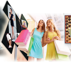
Rotation Video Wall