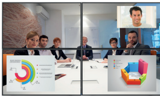
2x2 Video Wall