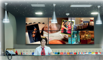
2x3 Video Wall