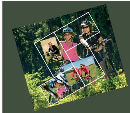
CORIOgrapher design canvas with virtual video monitors and video windows